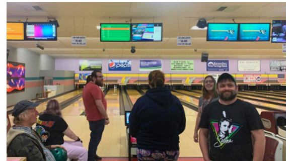
Extended Programming at Sparetime Recreation!