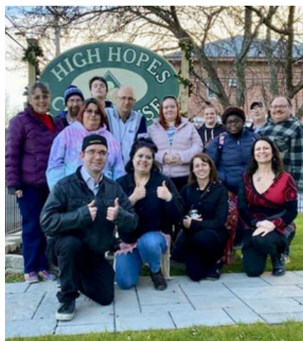
A group of Capitol Colleagues at High Hopes Open House event