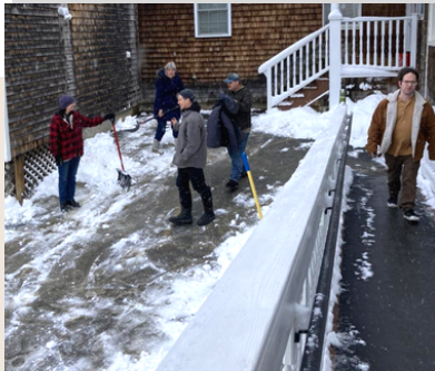
Colleagues tending to outdoor snow removal

The work done in the Clubhouse is exclusively the work generated by the Clubhouse in the operation and enhancement of the Clubhouse community. No work for outside individuals or agencies, whether for pay or not, is acceptable work in the Clubhouse. Members are not paid for any Clubhouse work, nor are there any artificial reward systems